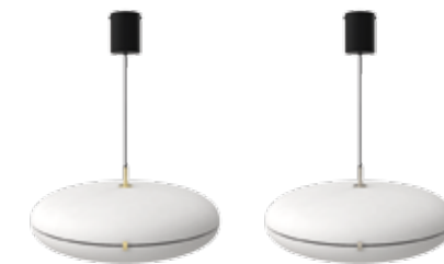
TLU100-1365 Satin Brass Satin White plastic