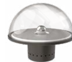
TSI300-2244 Manganese Crystal