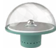
TSI300-3944 Green Crystal