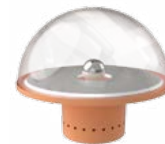
TSI300-3344 Orange Crystal