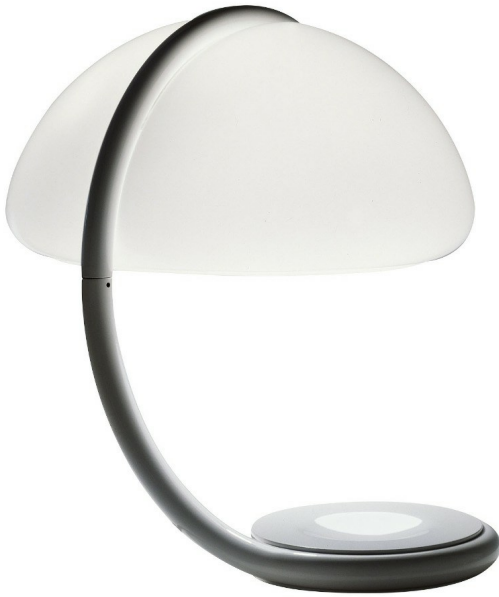
Table lamp with diffused light, swilling upper arm. White opal methacrylate diffuser. Arm and base are in white or golden lacquered metal. Designed in 1965 by Elio Martinelli, the lamp is made by acrylic techniques innovative for the time in which it was designed and revives the atmosphere of those years, decisive for the success of Italian design in the world.