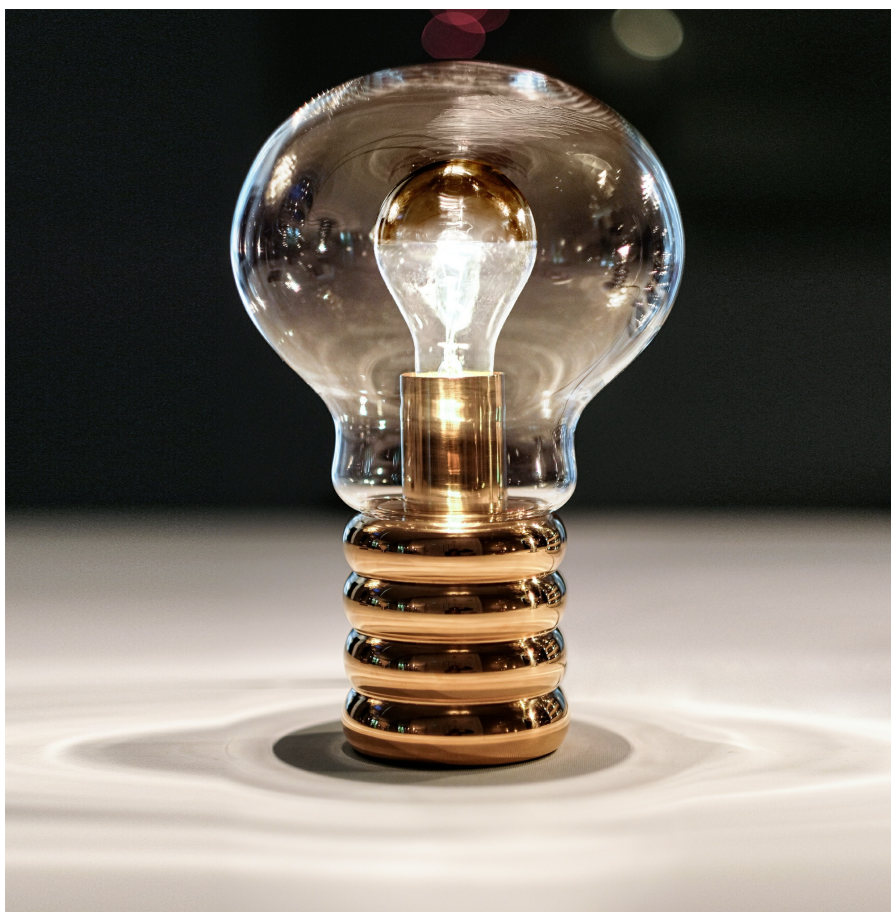
Bulb Brass INGO MAURER TEAM 2021

Brass base, mouth blown Murano crystal glass. Bulb Brass is the new member of the Ingo Maurer Bulb family. Based on the world-famous 1966 design, the Ingo Maurer team developed a brass version. The handcrafted lamp base is made of high quality brass. The untreated brass surface tends to change over time, giving it a special character. A patina is created, a surface created by natural aging. Patina is the result of daily use and is perceived as an aesthetic gain, as it stands for a characteristic material property that can ultimately be understood as the individual signature of the user.