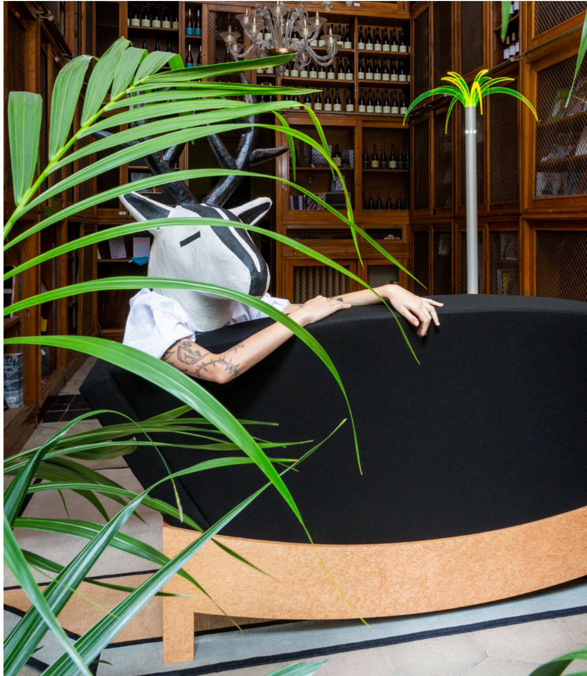
↪ Contemporary Cluster, Palazzo Brancaccio, Rome. 2021