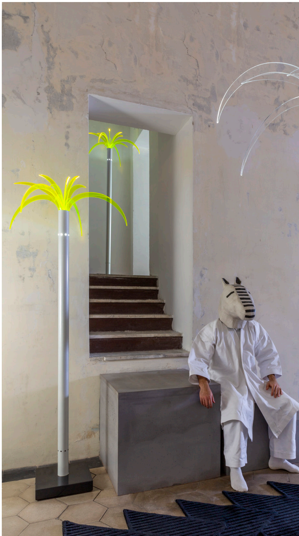
↶ Africano, Cluster Palazzo Brancaccio, Rome. 2021