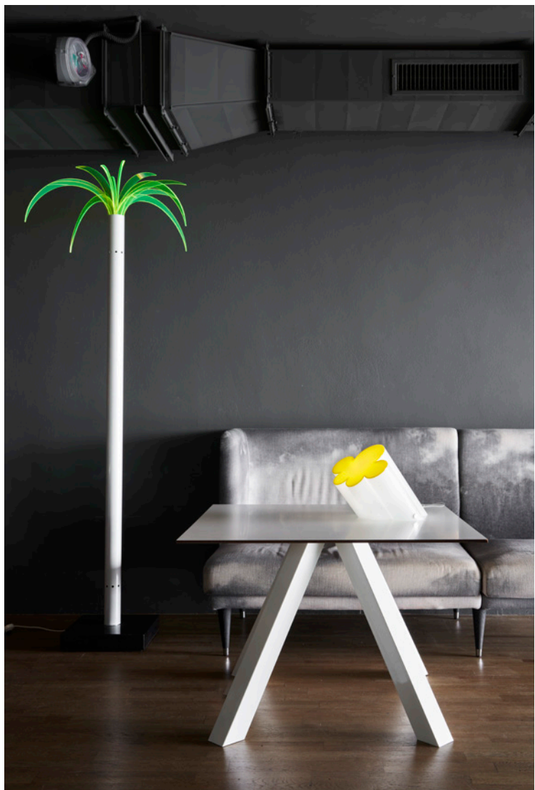
↖ The Student Hotel, Firenze. 2020