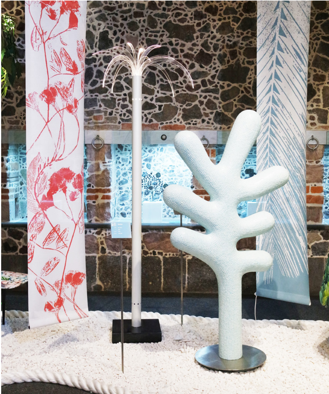
↙ Vegetal House, MUMEDI, Mexico City. 2018