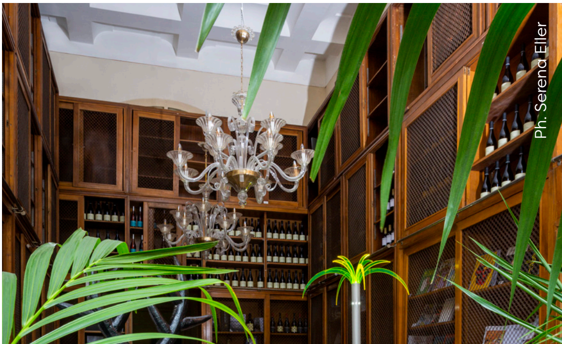
↴ Africano, Cluster Palazzo Brancaccio, Rome. 2021