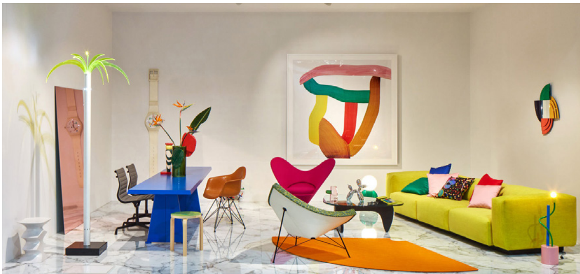
↖ Vitra booth, Milan Furniture Fair. 2019