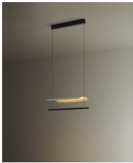
Lámina 45 / 85