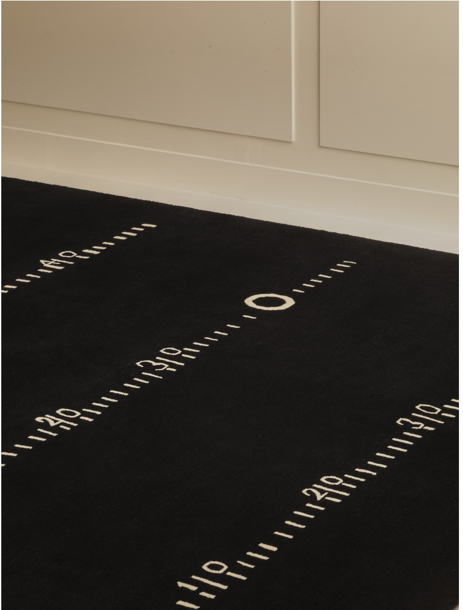
EILEEN GRAY (1879 - 1976)