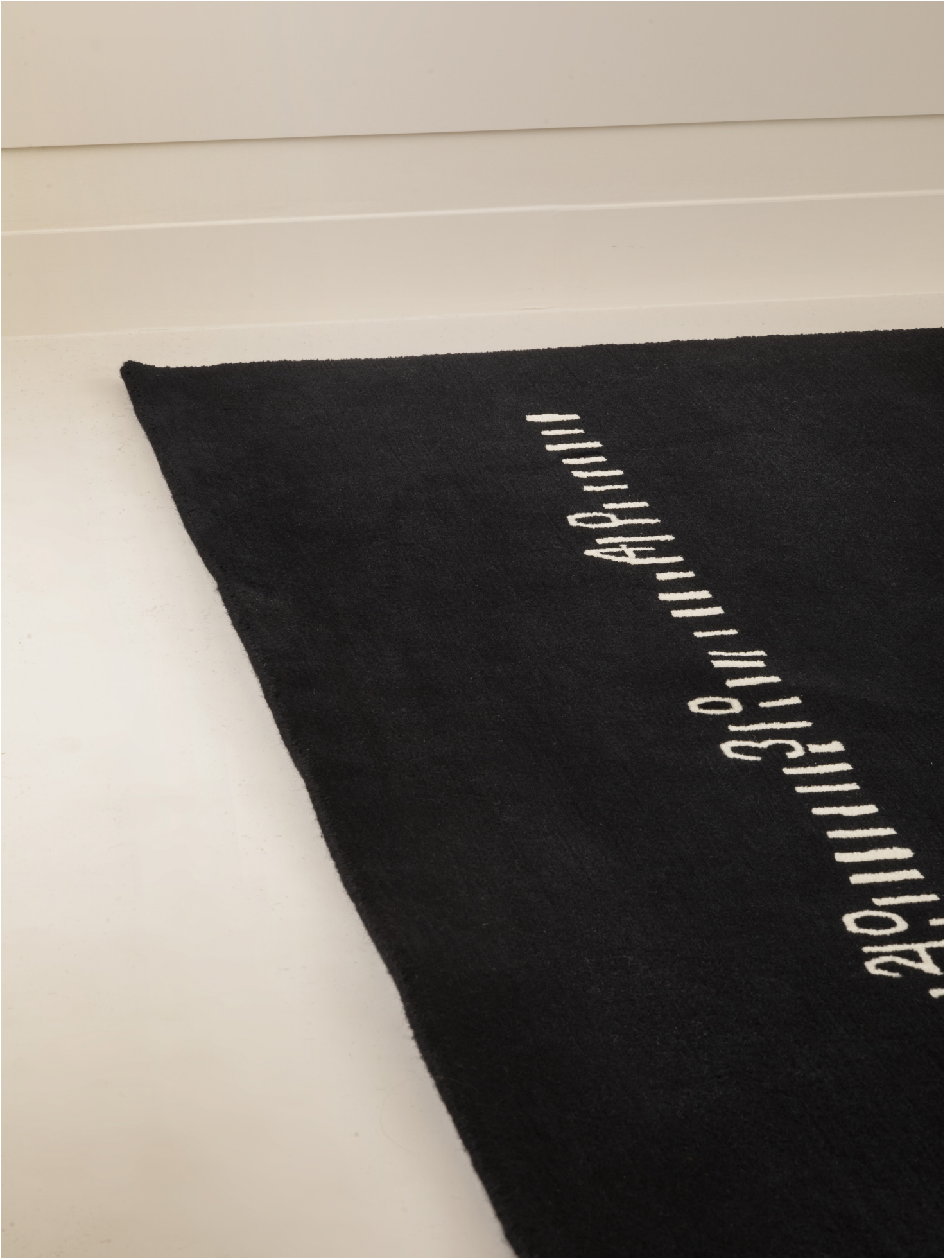
EILEEN GRAY (1879 - 1976)