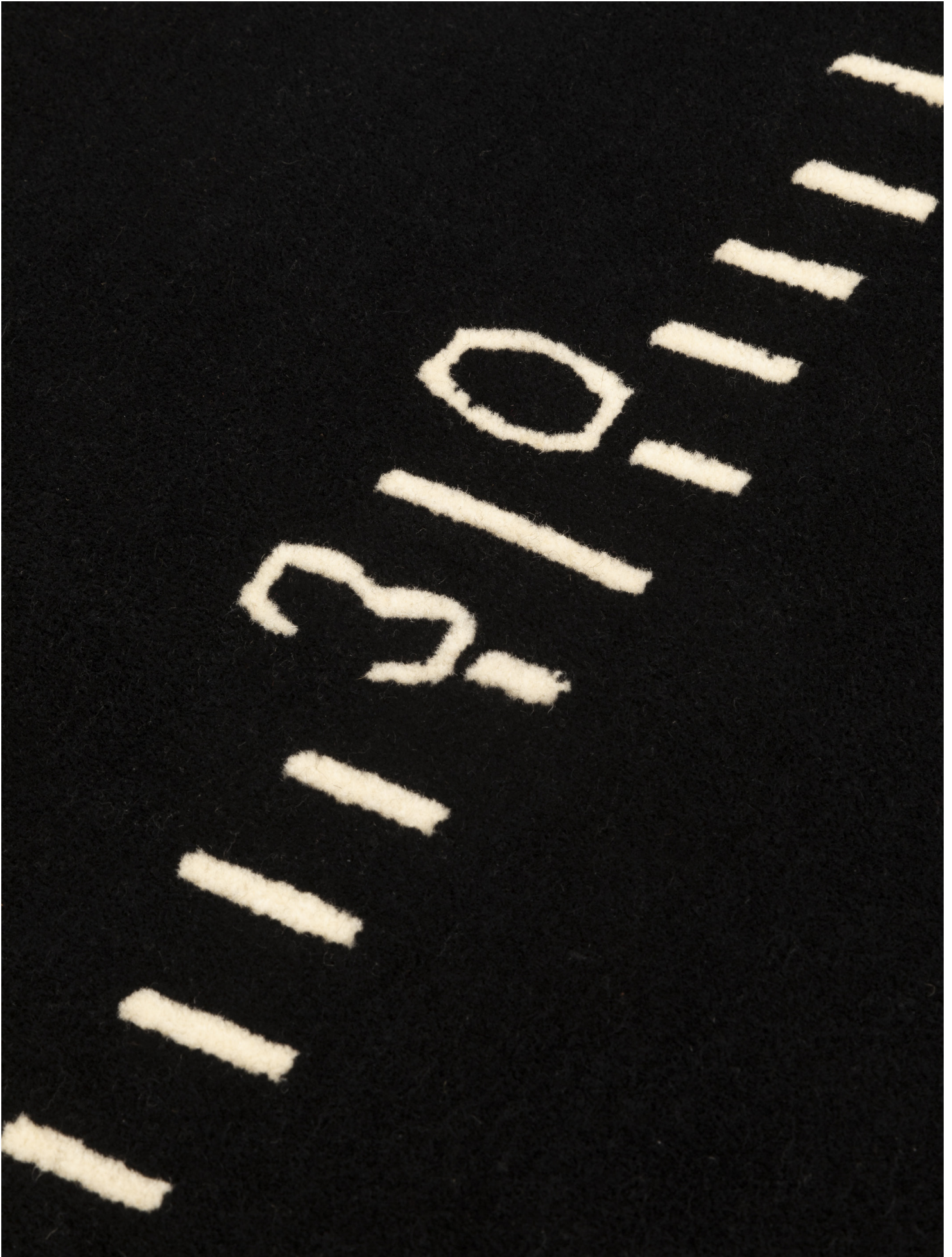
EILEEN GRAY (1879 - 1976)