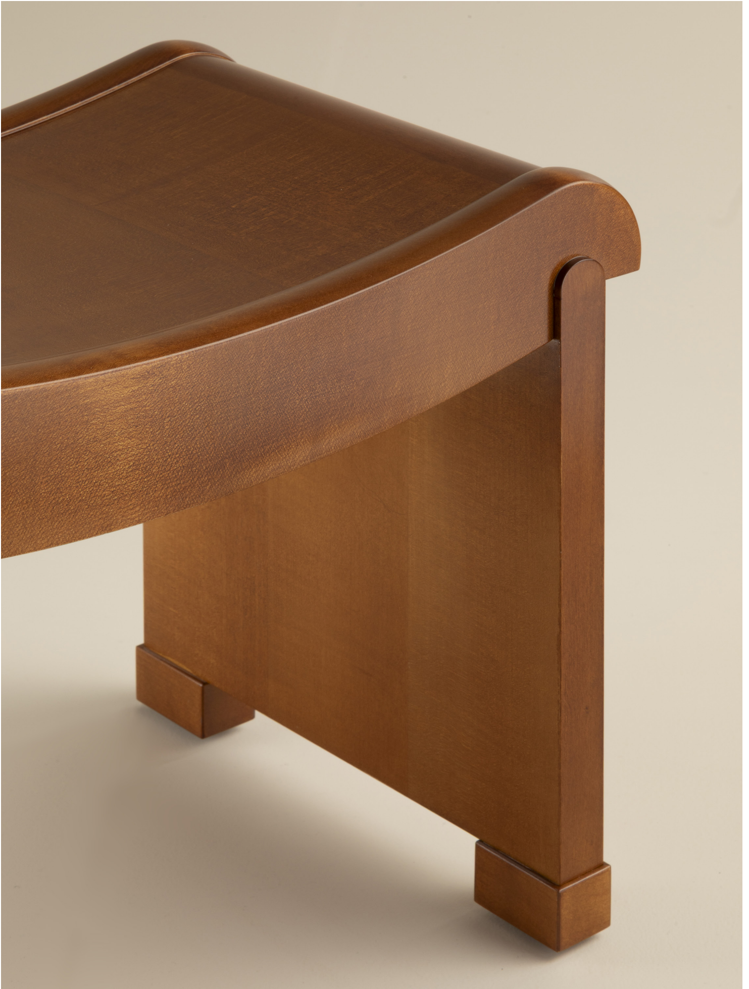
PIERRE CHAREAU (1888-1950)