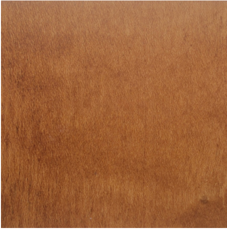
Dark blonde sycamore with satin finish