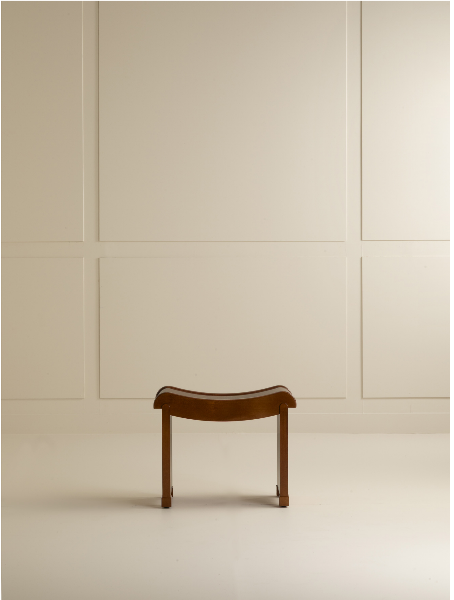
PIERRE CHAREAU (1888-1950)