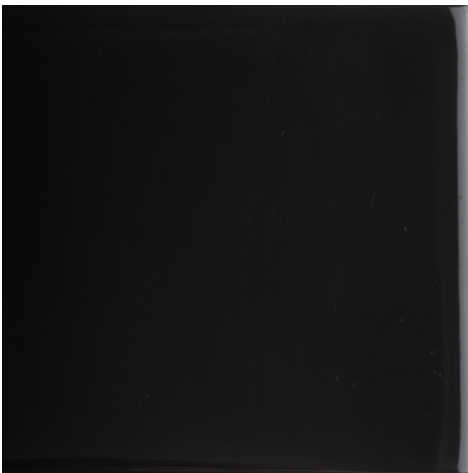
Black glossy sycamore