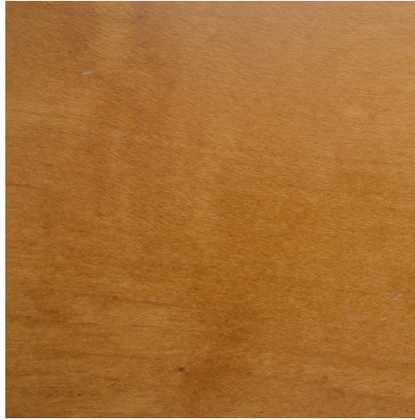
Light blonde sycamore with satin finish