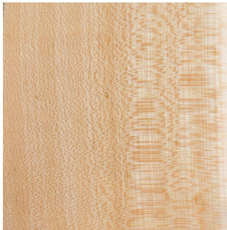
Natural glossy sycamore