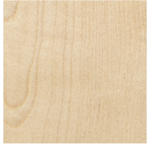
Natural sycamore with satin finish