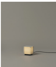
Shiro 17 Interior