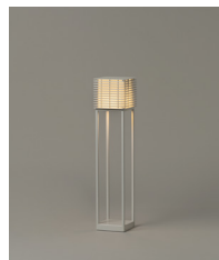
Shiro 17 Alta